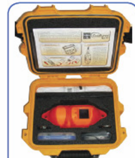
Each CastAway ships in this hard plastic kit, complete with accessories and quick start guide.