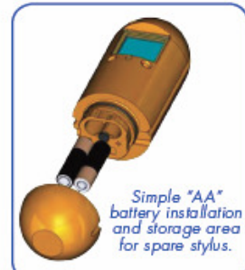
Simple "AA" battery installation and storage area for spare stylus.